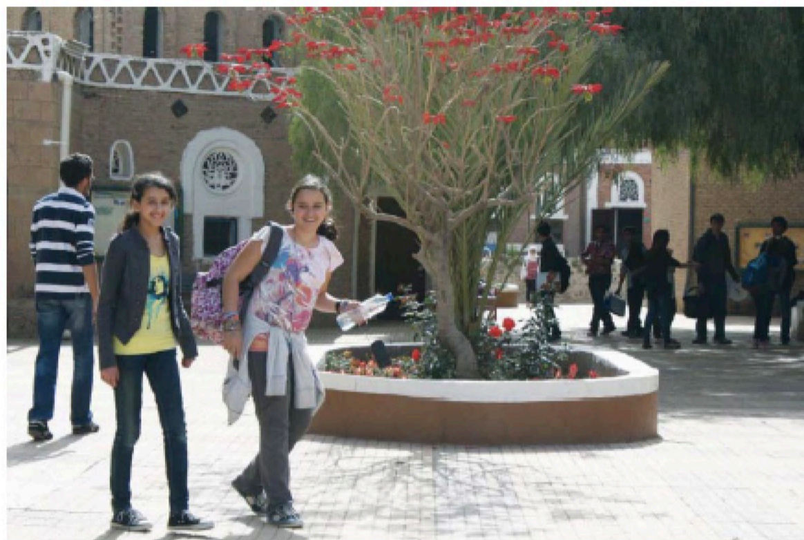
Students walk through the courtyard of Sanaa International School in Yemen before the school was temporarily closed due to civil strife and subsequently destroyed by bombs on 29 December 2015.

The BAES Faculty—as part of their professional development plan, commitment to our mission of lifelong learning, and desire to participate in capacity building in ... continued on p. 5