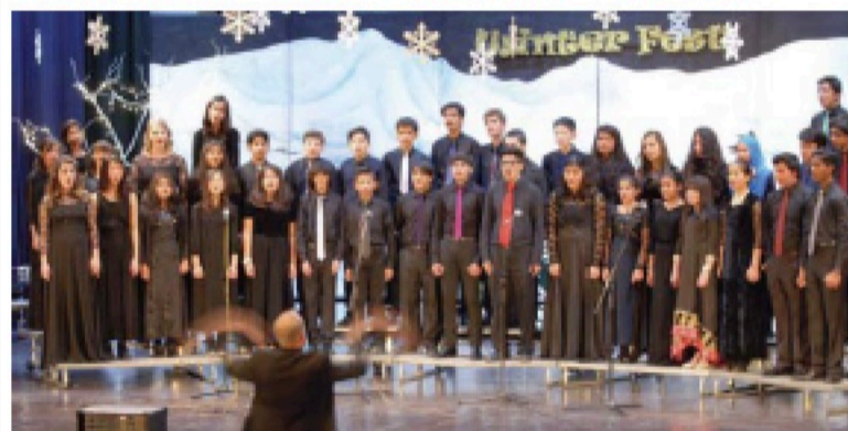
The choir at the International School of Islamabad sings a requiem.