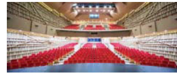
The new Sound Constellation acoustic system honoring Paula Silverman is top-of-the-line.

The Constellation acoustic system illuminates the results of faculty leadership over many years. Meyer Sound's package of equipment and technical support services, involving the Variable Room Acoustics System™, enables sound settings to be pre-programmed and instantly altered for different performance types,