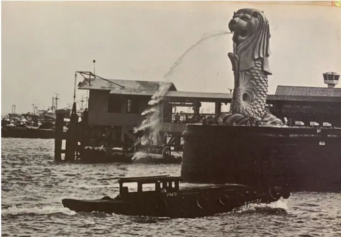
The Singapore Lion in 1975.