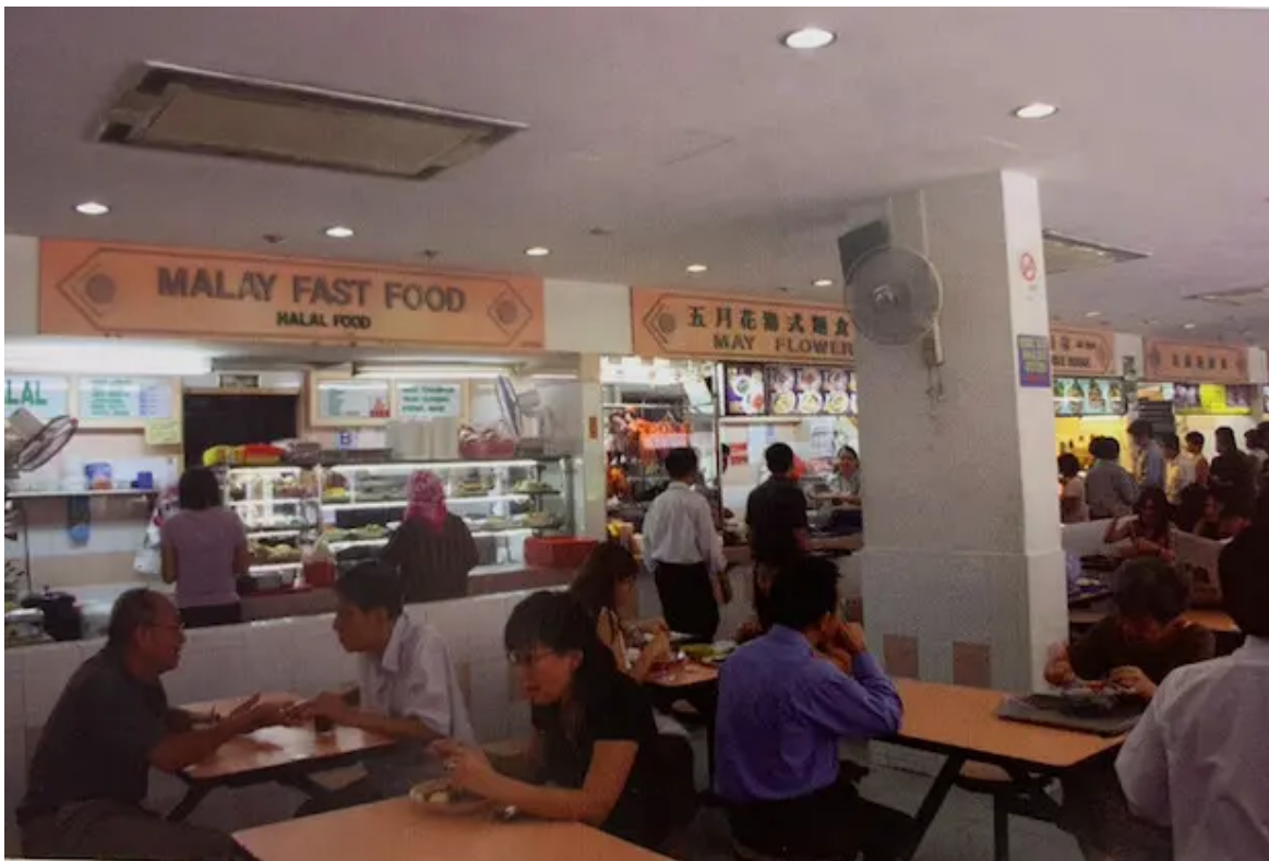
Hawker market in the 1990s.